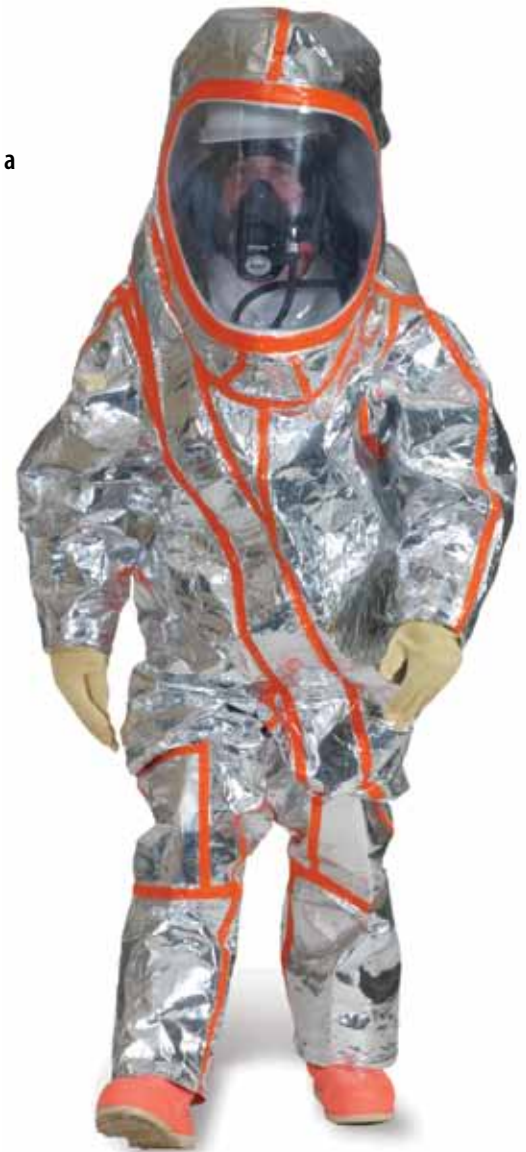
Frontline® 500 offers triple protection, including excellent radiant heat protection.